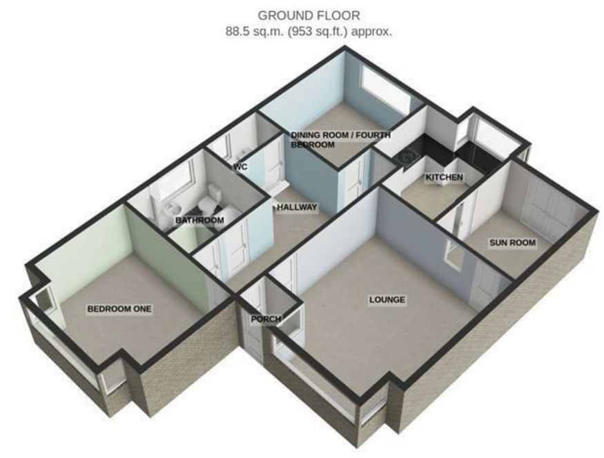
GROUND FLOOR 88.5 sq.m. (953 sq.ft.) approx.