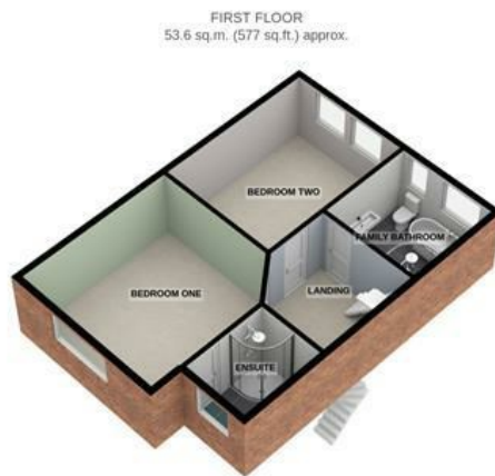
FIRST FLOOR 53.6 sq.m. (577 sq.ft.) approx.