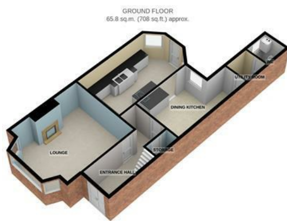
GROUND FLOOR 65.8 sq.m. (708 sq.ft.) approx.