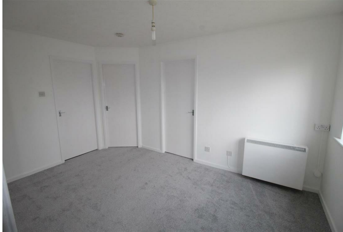
Buildings insurance - £77.31 per annum Years left on the lease - 852